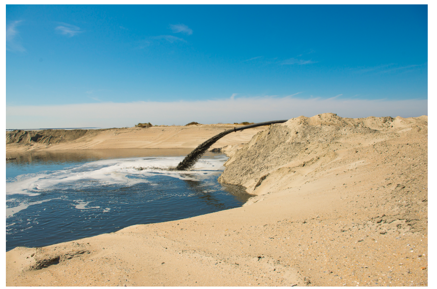
Figure 1. Dredge de-watering site

This de-watering site is a basin where water is allowed to drain from the dredge spoil leaving the sediment behind. What remains is an amalgamation of sediment including gravel, sand, silt and clay. The characterization of these different remains relates to their size.