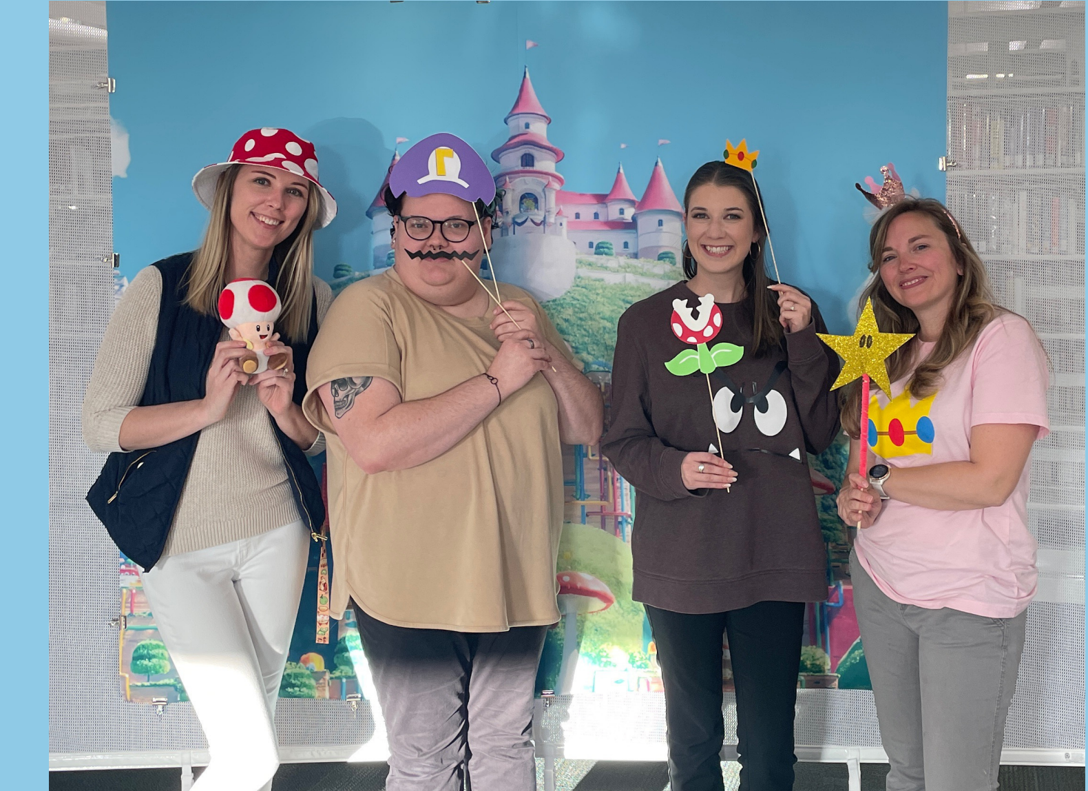
This program took place in April 2023 following the release of The Super Mario Bros. Movie .